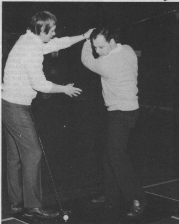
No, No, No...Sir..Not That Way... This Way....

Lipsett Hall 30 Apr. — 18 May 73 Westwin Rec Centre 28 May — 1 June 73.