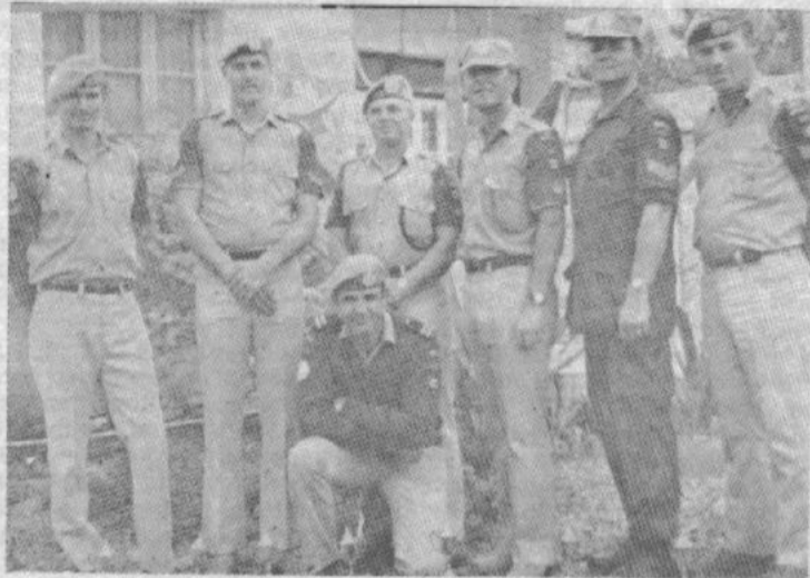
CANADIANS DART CHAMPIONS. The Canadian Contingent once again demonstrated its fantastic athletic prowess by defeating all comers in a UNFICYP Dart Competition.