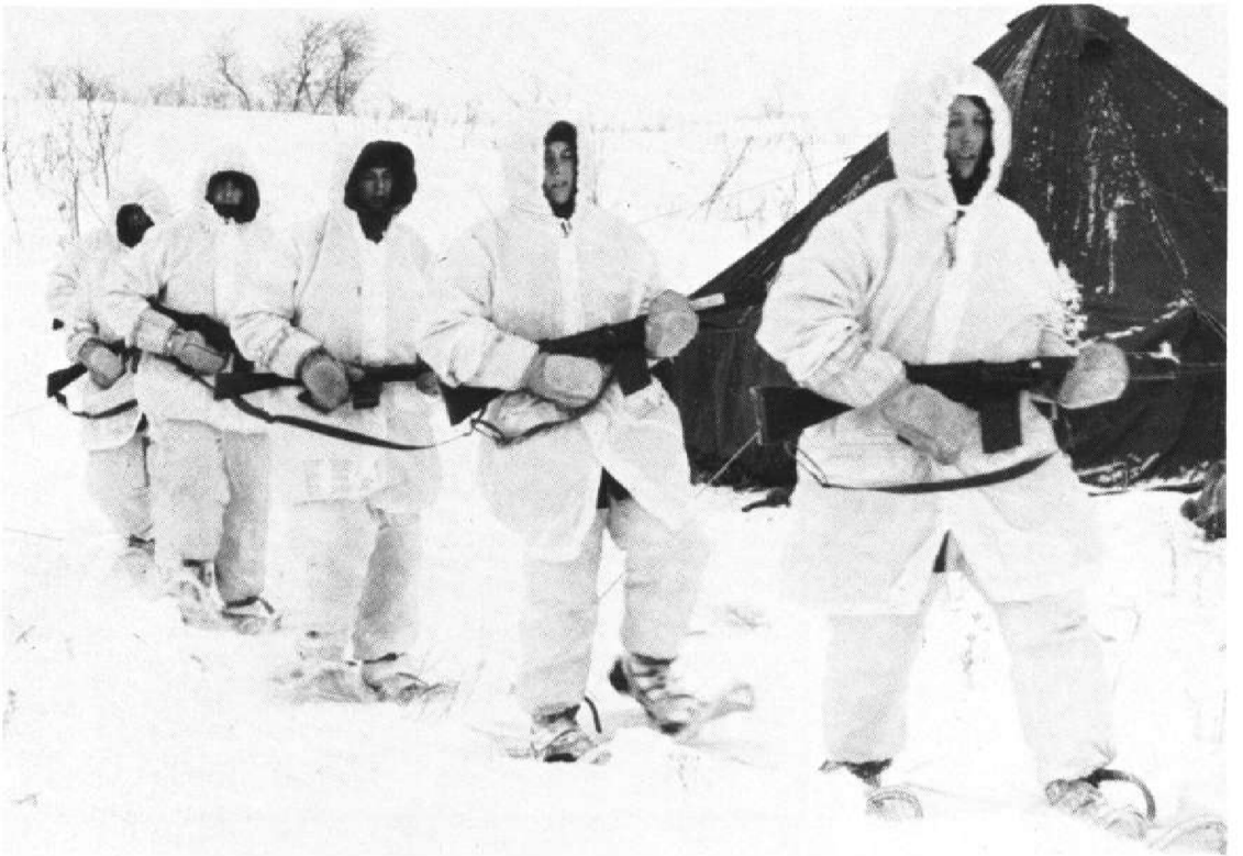
THE "ENEMY" LEAVES FOR PATROL . . . This unglamorous role was played by "B" Company, 2 PPCLI, Win-

"We were extremely pleased by the performance of the RCHA's Air Observation Post Troop light aircraft and with the strike and reconnaissance support of the CF-5 jet aircraft working out of 434 (TF) Operational Training Squadron at CFB Cold Lake." Colonel Hutchinson said.