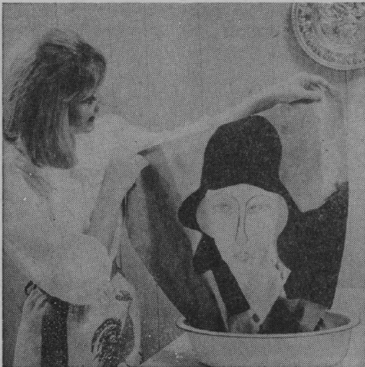
DESIGNING WOMAN — Make an attractive wall hanging right in your own kitchen. A fascinating craft currently enjoying new popularity across the country is batik-printing — an ancient art of producing designs on cotton with fabric dyes and melted wax. Here, a wall hanging is being rinsed after its final bath in Tintex black dye.

Thanks to the updating of an ancient craft, you can now be a designing woman and have handsome wall hangings to show for it.