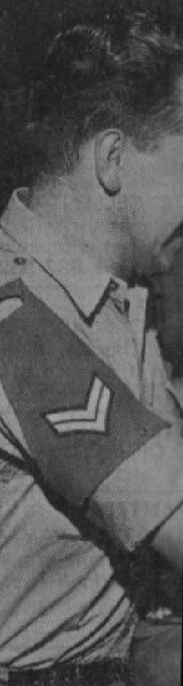
PMC of the Cpls C... sentation of a trophy to