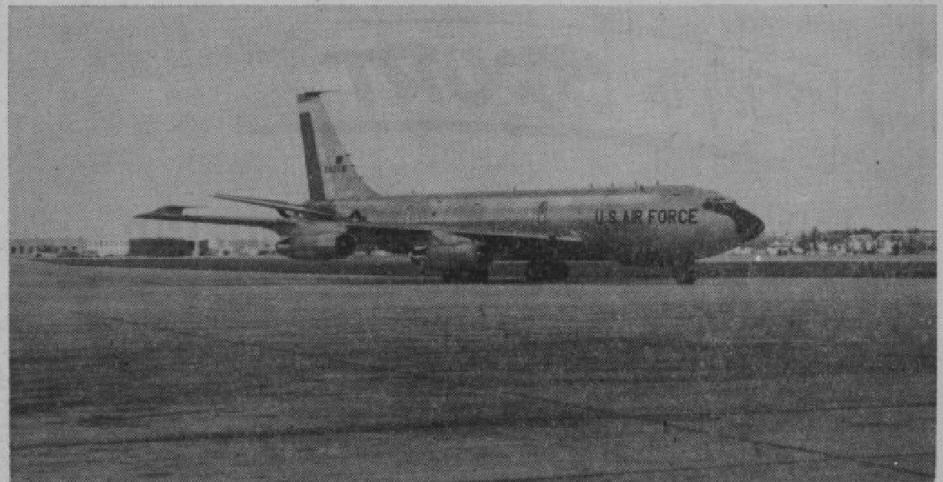
The C-135 from Andrews AFB brought the members of the Permanent Joint Board of Defence to RCAF Wpg. 20-24 Sept. 65.