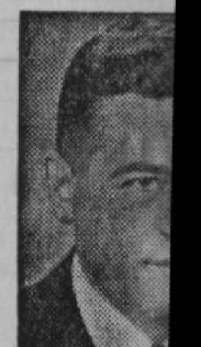
AL. CHA... B. Comm... At you

Introducing Enhanced Pr... Premiums (s... available on