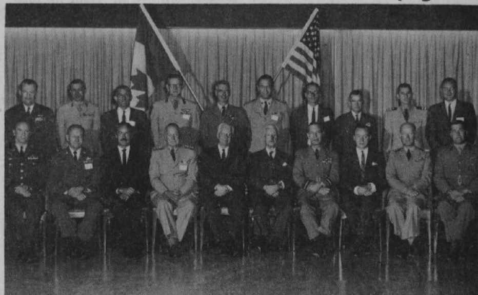
RCAF Winnipeg had the honour of hosting the 113th meeting of the Permanent Joint Defence Board from 20-24 Sep. The PJDB was initiated in 1940 by President F. D. Roosevelt and Prime Minister Mackenzie King and meets 3 times each year.