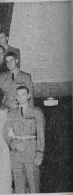
our photographer during on

why they are so... get back to work... do in the way of... exercise, do it within... tations.