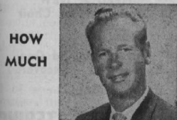
A. GRIERSON GR 5-7310

Are You Earning $300.00 Per Month? $400.00? $500.00? In 20 years you will have earned $72,000 - $96,000 - $120,000