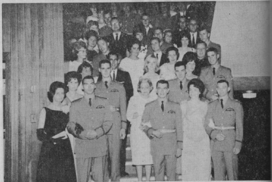
Graduates, with relatives and friends took a few minutes to pose for our photographer during an enjoyable evening.