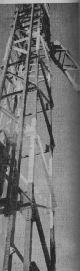
undergoes a "ride" on the Aero Medical Training Unit including a "tower shot" Aviation Physiology Course and "jet pilots in the g training.