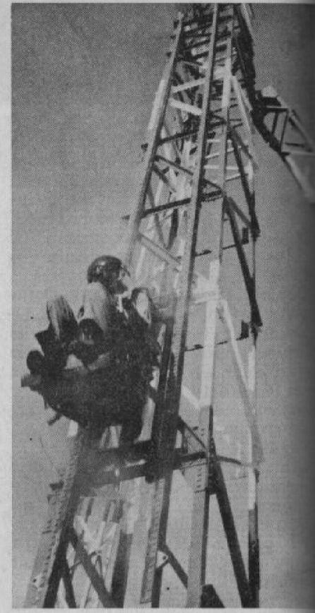
F/O Bob Barry undergoes a "ride" on the Ejection Tower at the Aero Medical Training Unit. Ejection training including a "tower shot" is a part of the Aviation Physiology Course conducted for all "ab initio" jet pilots in the week of their flying training.