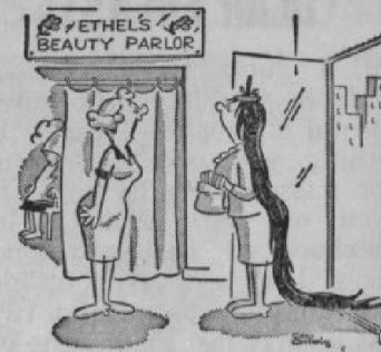
"Long time no see."

OCCASIONAL DAYTIME BABY SITTER, beginning in September. Ph. VE 2-5679.