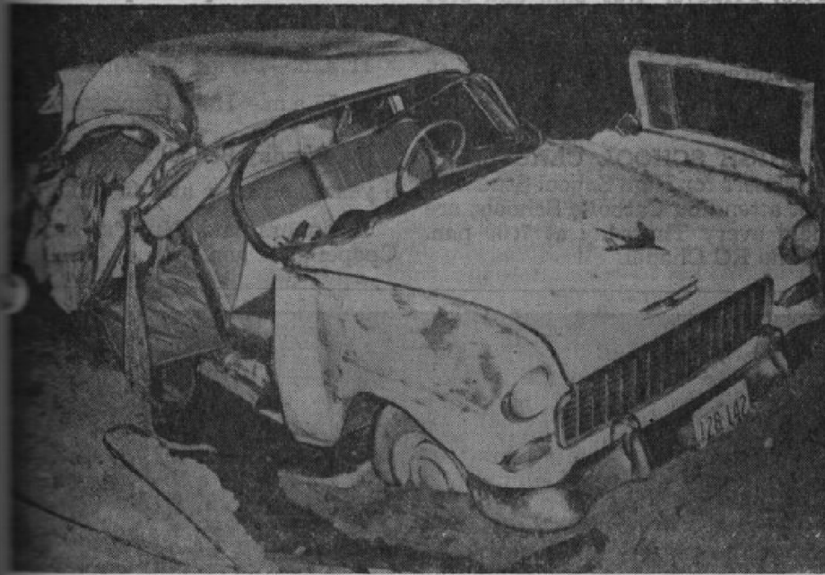
Don't allow your car to end up like the one shown above. A safety check from the station section will point up any mechanical faults your car may have. Don't wait — Do it now!

"Check your car for spring," urged the Canadian Highway Safety Council in announcing its annual April-May car-check campaign. The campaign opened on Saturday, April 1, and ends on Monday, May 3. Vehicles leaving a hard winter of driving need a thorough going-over by a trained technician, the Council stated.