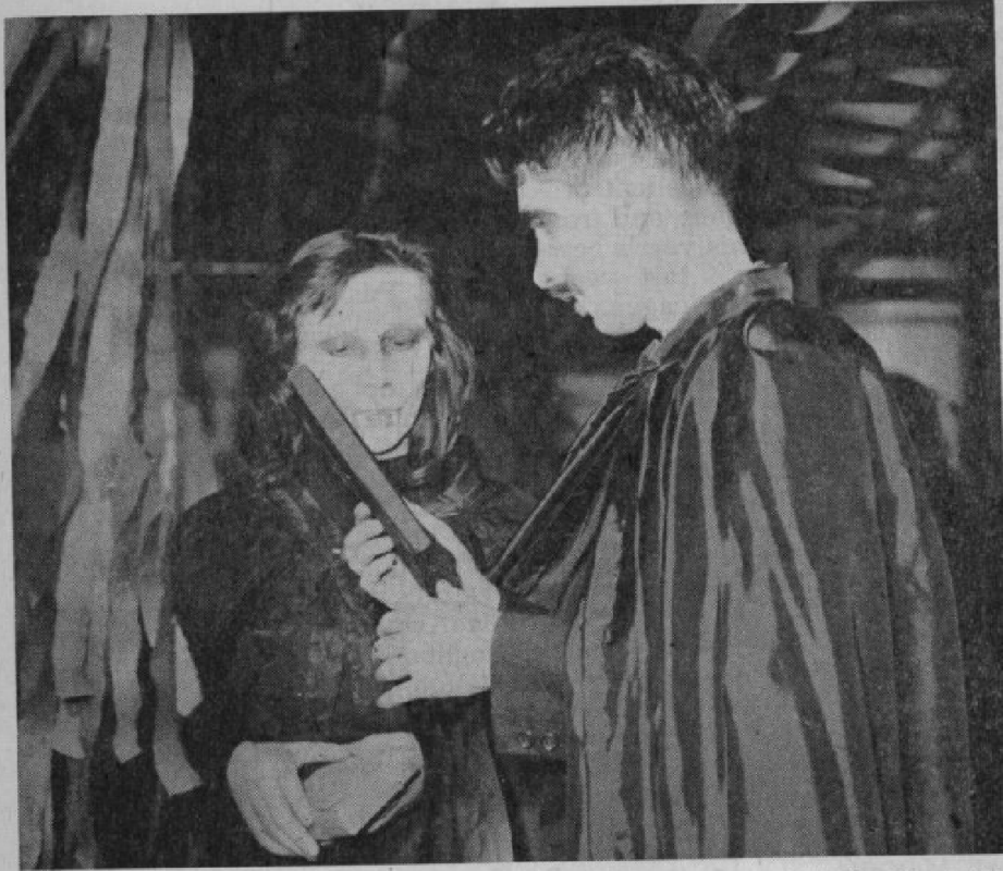
Who needed the "Munsters" and "Adams Family" when the Count and his Ghoulfriend visited the club last Saturday evening? They are pictured drooling over the prize they dug up during the night's revelry.

It is obvious by the accompanying photo that Hallowe'en in Club 61 was, without a doubt, the most successful and interesting display put on by your Entertainment Committee and members this season. Approximately 75% of those who attended this dance were in costume. This made it extremely difficult for the judges to choose winners. After considerable viewing and discussion the winners announced were Count and Mrs. Dracula. Following closely in the place for top honours we had Mrs. Witch and the Club's own New