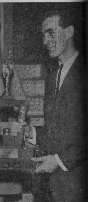
Champion, Junior League Champions.