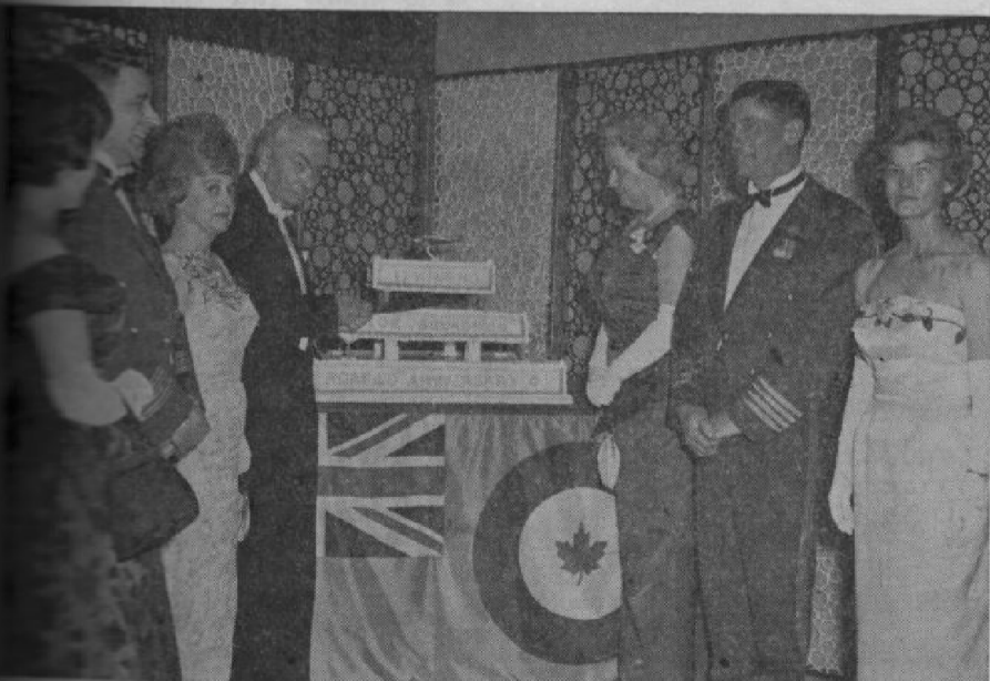
. . . . or Slice a Cake