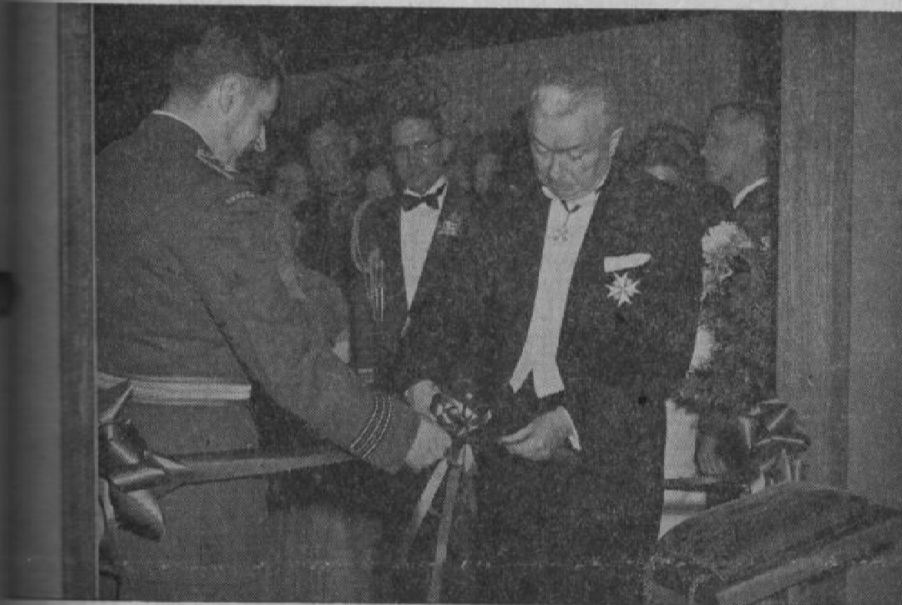
To Cut a Ribbon . . . .