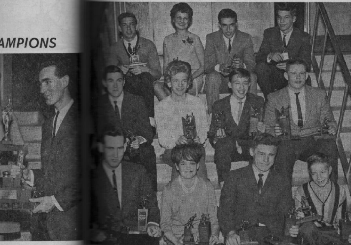
Junior League Curling Winners: Bottom row, A Group Event; Centre row, B Group Event; Top row, C Group Event.