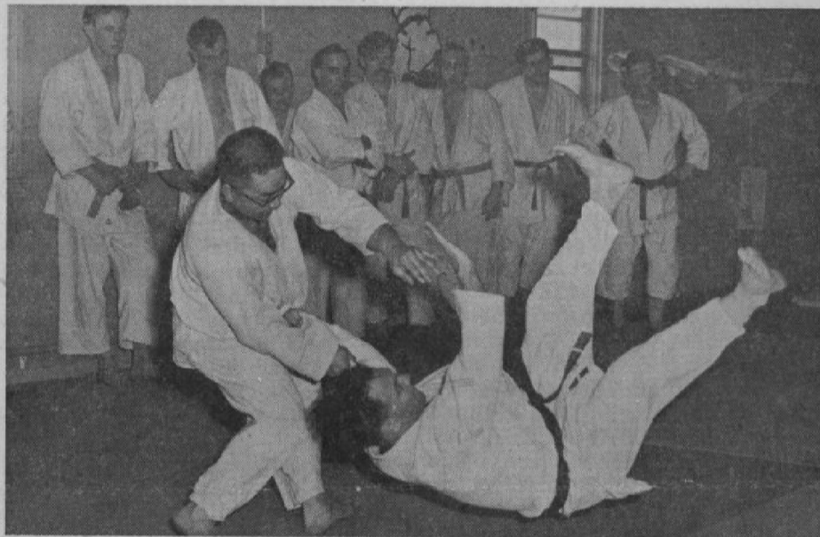
To Shoulder Throw . . . .

Judo is now becoming one of the most popular and practiced sports in the Armed Forces.