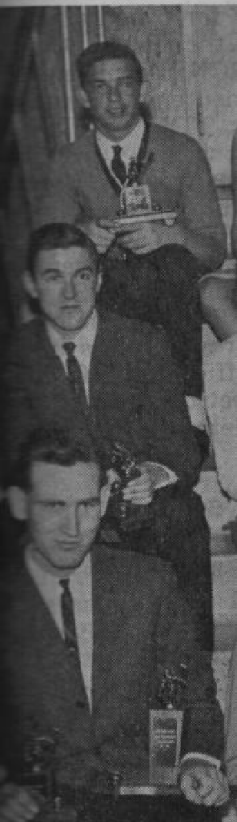
Junior League Curling Win C Group Event.

On Monday, April 13, the Winnipeg Canoe Club will hold a demonstration of canoeing.