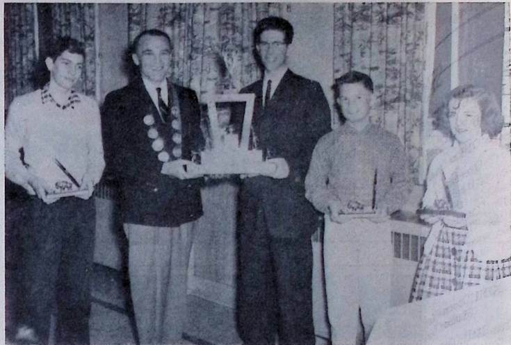
Mayor presents trophies to winners.