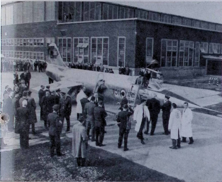
Roll-out of the first of 200 CF-104 aircraft for the Royal Canadian Air Force took place today on schedule at Canadair Limited, Montreal. The Canadair CF-104 is a strike-reconnaissance airplane for service with the R.C.A.F. No. 1 Air Division, operating with NATO forces in Europe. It has the capability for all-weather flying at supersonic speeds and at low or high altitudes.