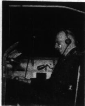
His Excellency the Earl of Athlone, Governor-General of Canada, in a Link Trainer.