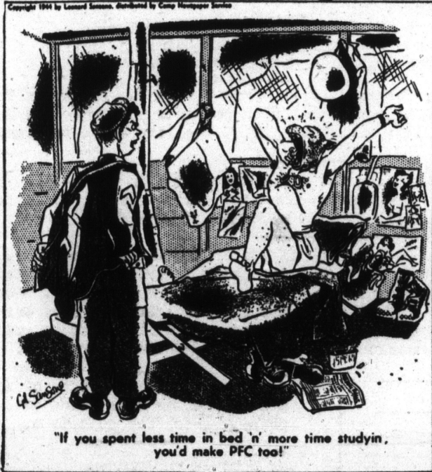
"If you spent less time in bed 'n' more time studyin', you'd make PFC too!"