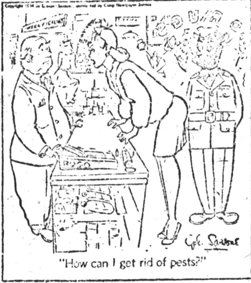
"How can I get rid of pests?"