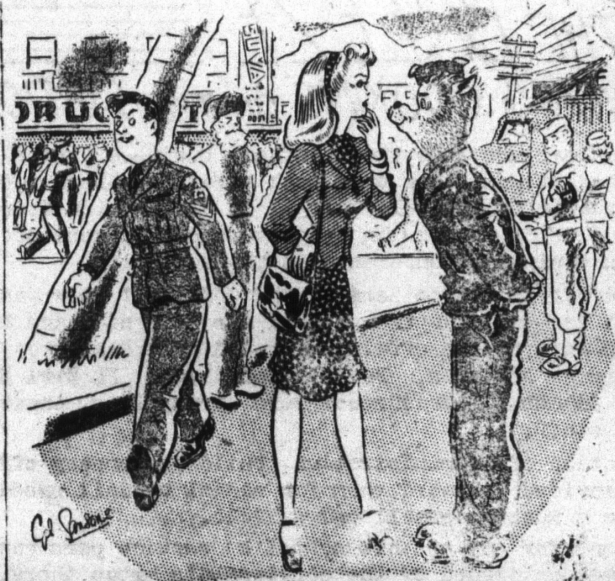
"Your face isn't familiar ... but your 'line' is!"