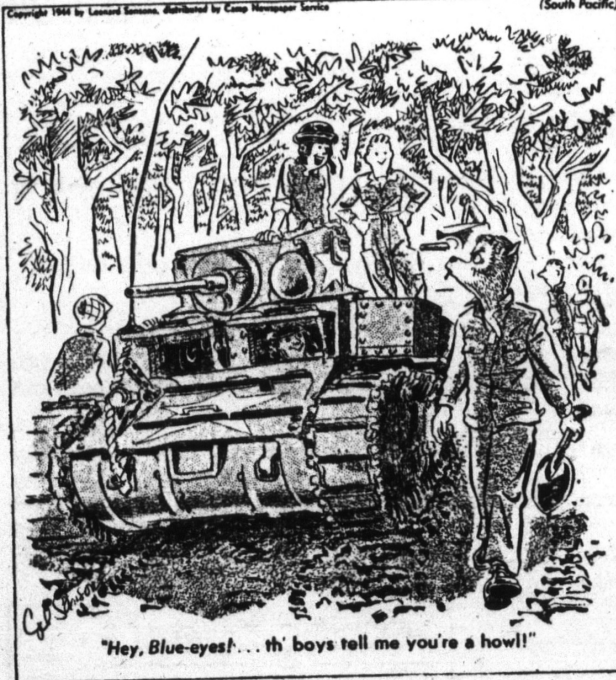
"Hey, Blue-eyes!... th' boys tell me you're a howl!"