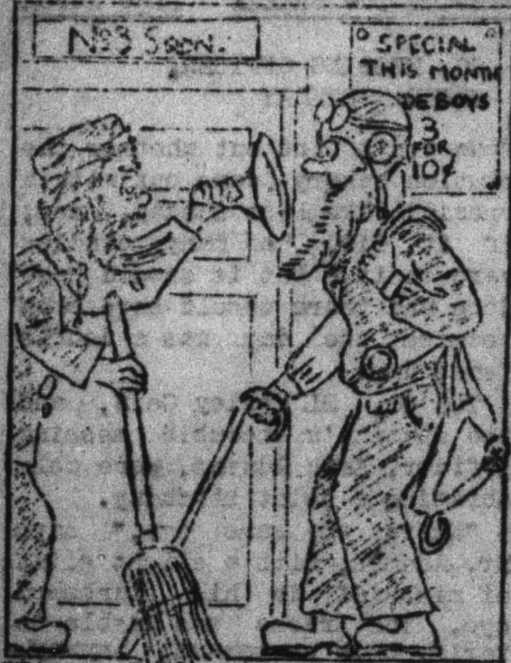
"Figure I'll get on course next year, if no more NCO's come in"