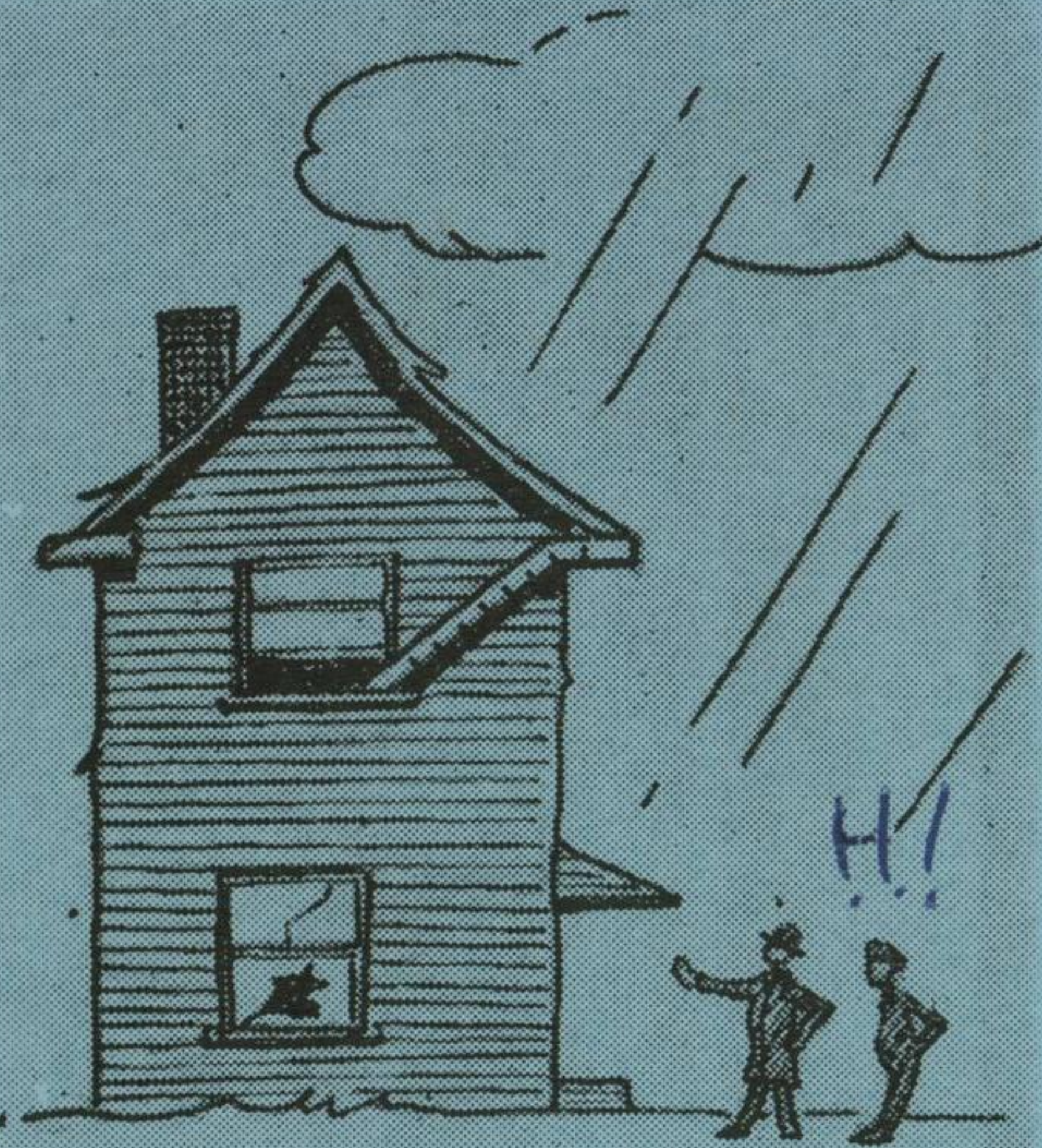
"Only $110 a month, complete with running water."

station being built up all around and to imagine what it will be like in a year or so. "The Trenton of the West," it has sometimes been called, and we hope that one day it will surpass even that pioneer station as an example of what the R.C.A.F. can do.