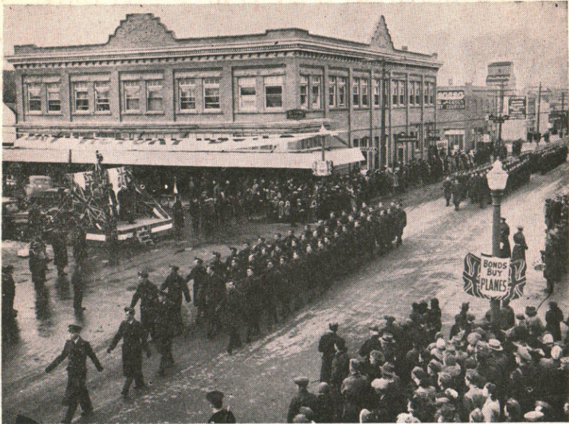
With a total of $56,150 raised in the Fifth Victory Loan Campaign, 36 S.F.T.S. established a record for R.A.F. Schools in No. 4 Training Command.