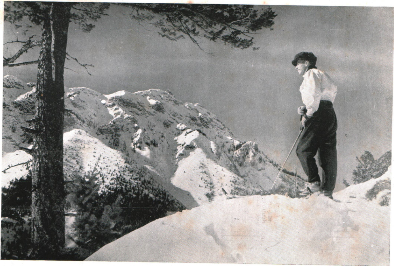
Ski Trail at Norquay, Banff