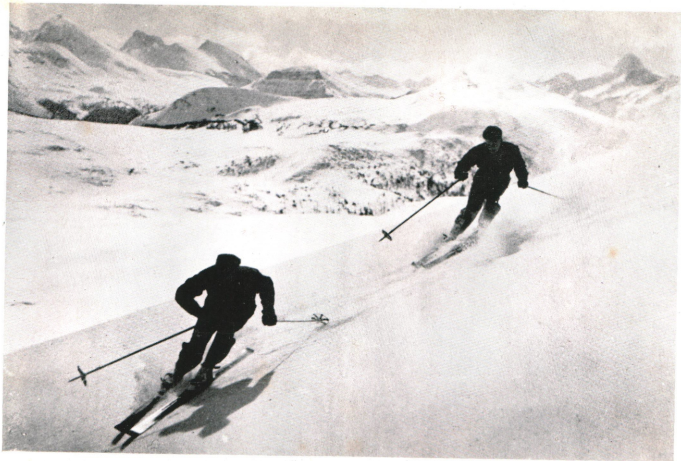
Above the Timberline at Sunshine