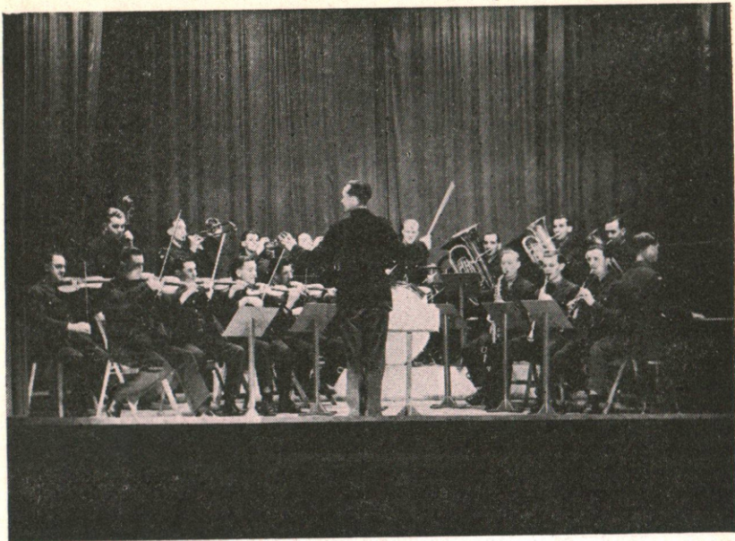
THE STATION ORCHESTRA