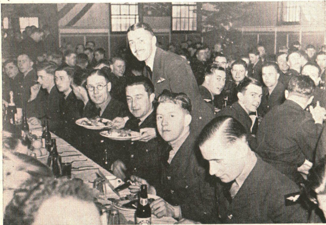
The Officers Serve the Airmen With Christmas Dinner.