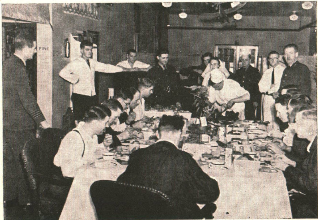
Patients of the Station Hospital "Dig In" When Christmas Dinner Is Served.