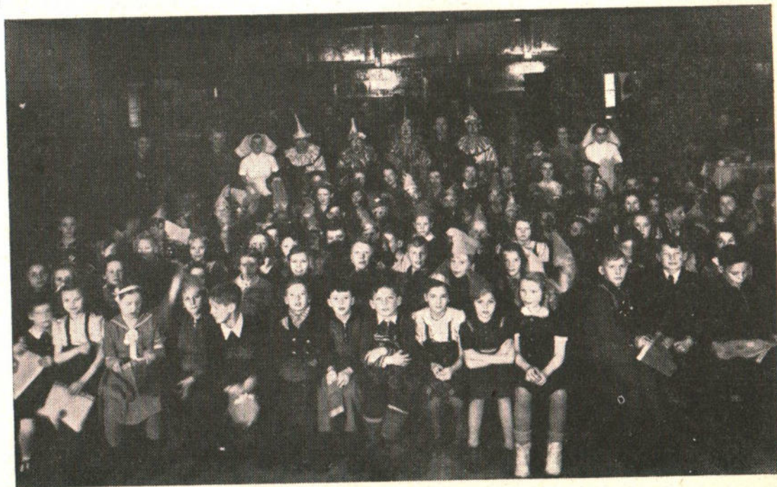
R.A.F., Penhold, Entertains Local Kiddies To a Christmas Party

Noted at the December dance—a handsome backcloth for the bar consisting of much aeronautical heraldry surmounted by a control column rampant and the motto "Dedigitare" (which latter the bar stewards assured us applied to those in front of the bar, not the workers behind it.)—still another Conga line leader Teareing all over the place—the Penhold Conga trio might now put on an act.