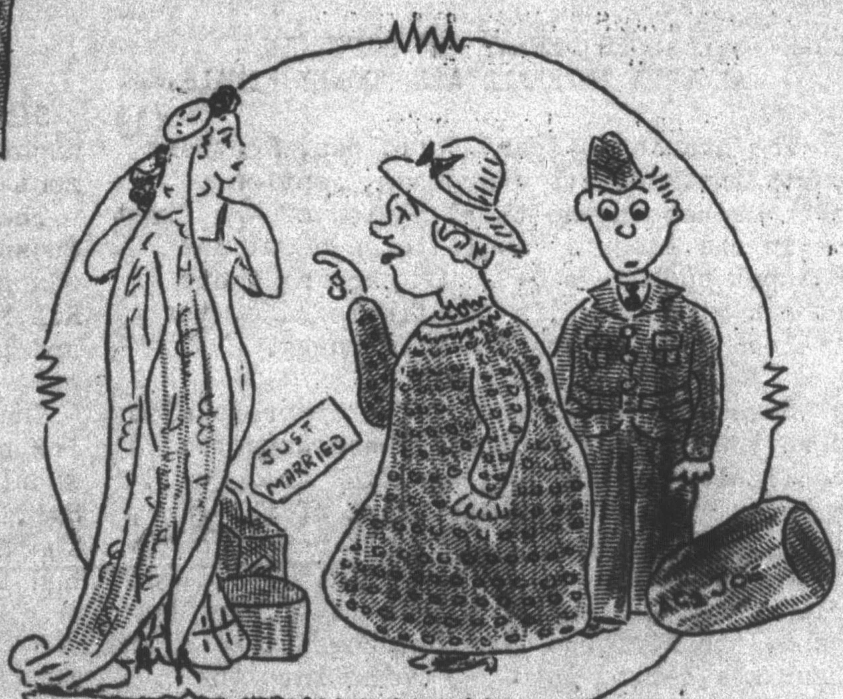
A GLASS OF WARM MILK BEFORE HE RETIRES AND HE'LL FALL ASLEEP WHEN HIS HEAD HITS THE PILLOW