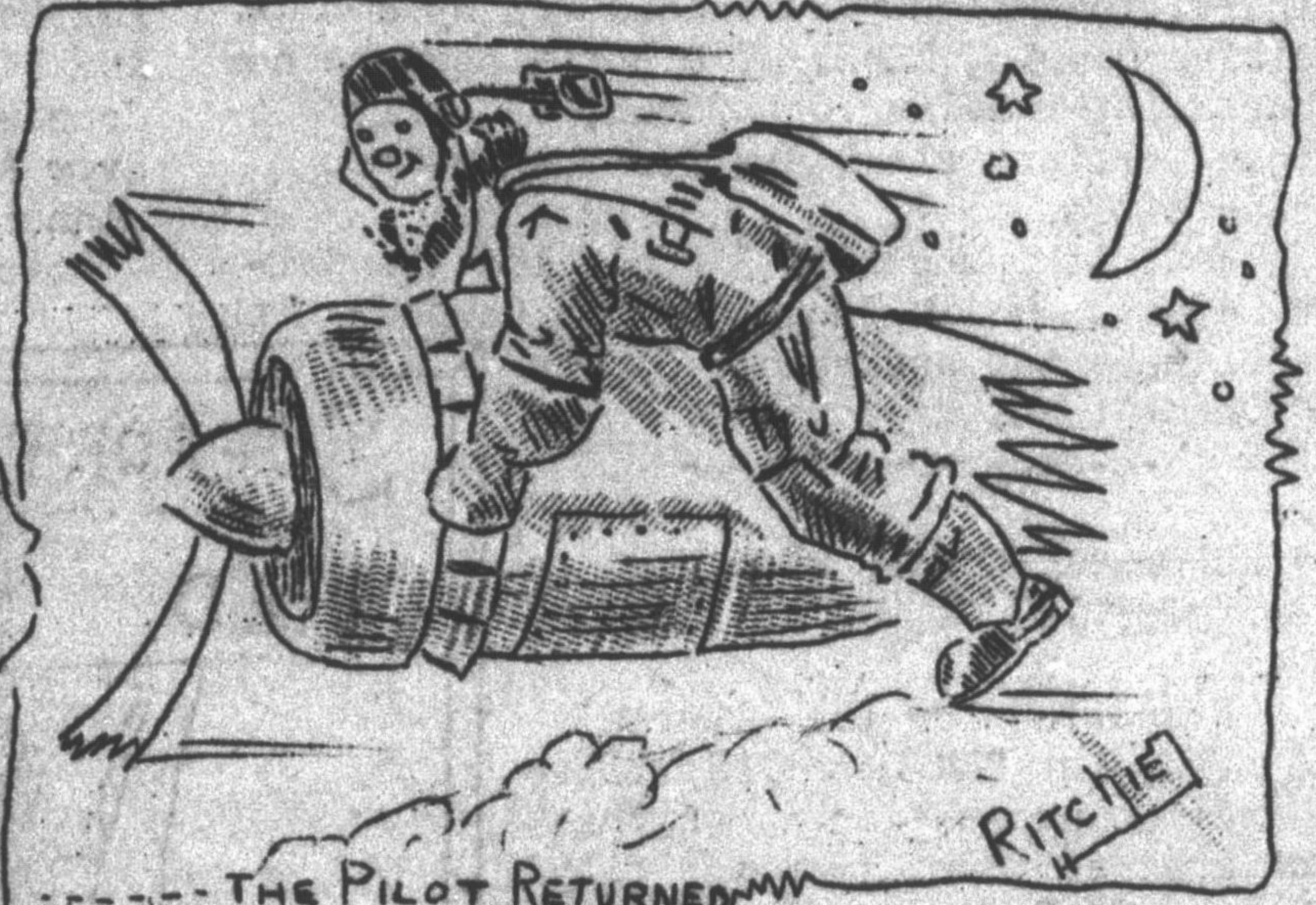
THE PILOT RETURNED SAFELY ON ONE ENGINE.