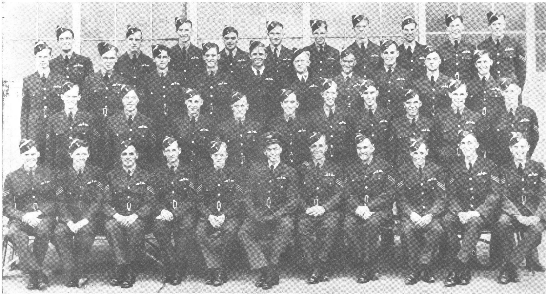
No. 15 S. F. T. S., Claresholm, Alberta Course 84 : Wings Parade : 13th. October, 1943